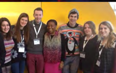
Part of Welfare Zone