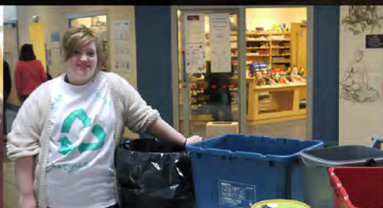
Achieving Green Impact Gold!